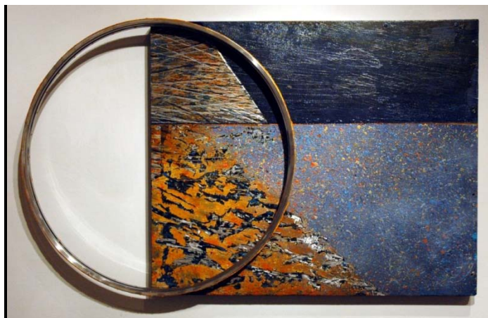
Al Hinton, New Moon