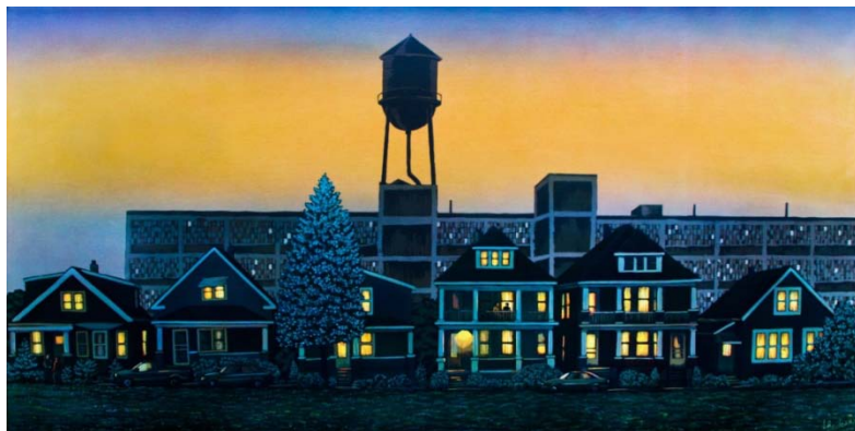
Lowell Boileau, Wesson Street